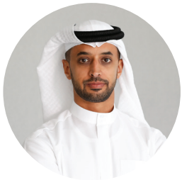
Ahmed Bin Sulayem, Executive Chairman & Chief Executive Officer, DMCC